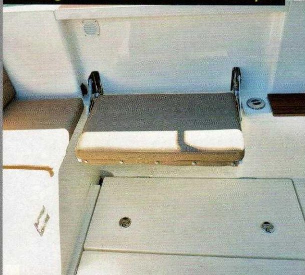
Folding seats each side in the cockpit