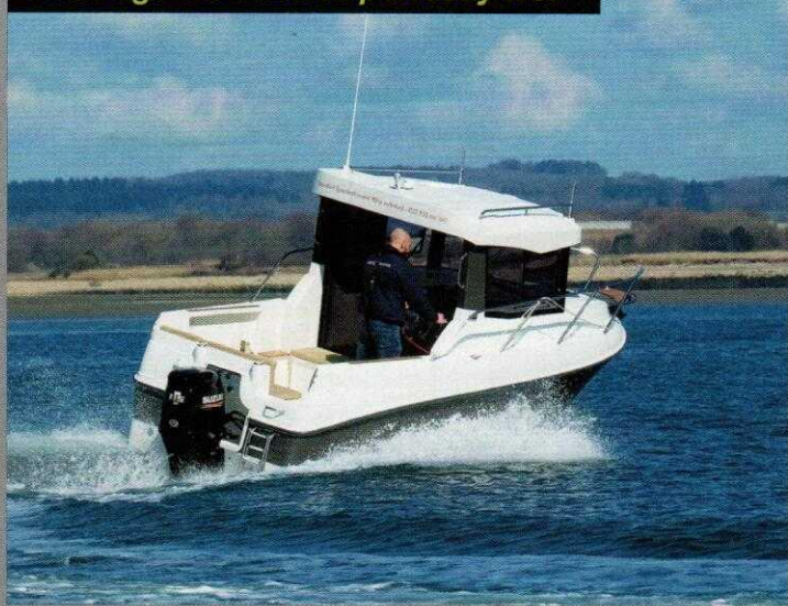
The Pegazus handles perfectly well